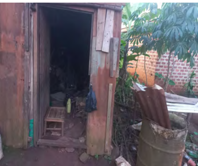
Nalumansi’s water harvesting drum before

Furthermore, the water tank became a source of additional income for Nalumansi. During rainy seasons, she began selling water, diversifying her income stream. This shift in livelihood resulted in an increase from an estimated 1000 shillings per day, earned from the original sale of sugarcane, to 3000 shillings per day solely from selling water. The project not only addressed a fundamental need but also fostered community cooperation and enhanced the economic well-being of the elderly beneficiary.